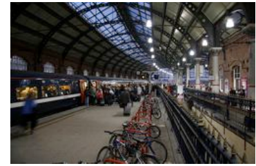
Above: Darlington Station