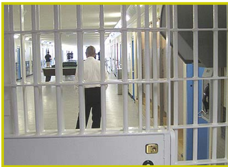
Behind bars on one of Polmont YOI wings